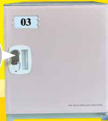
External look with latch type lock