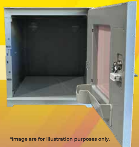
Internal look with hooks & mini shelf

*Image are for illustration purposes only.